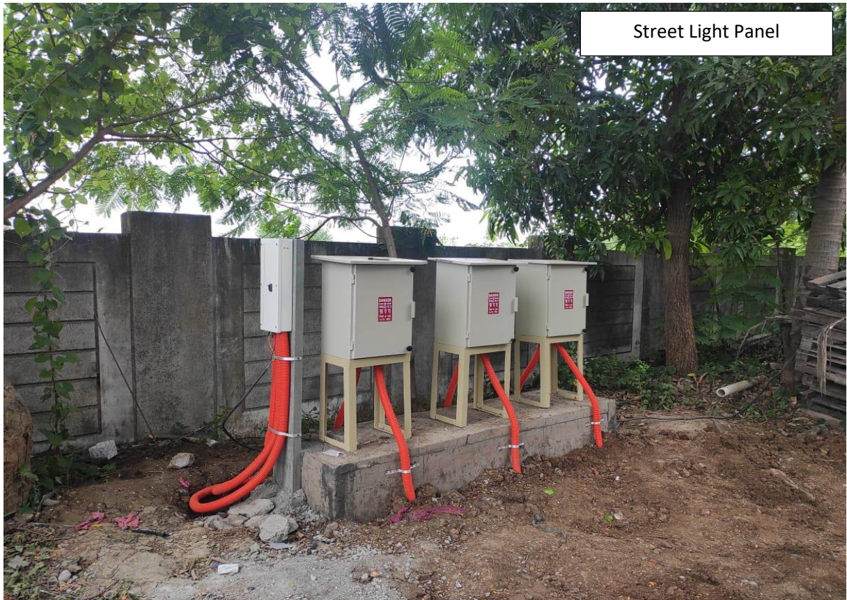
Street Light Panel