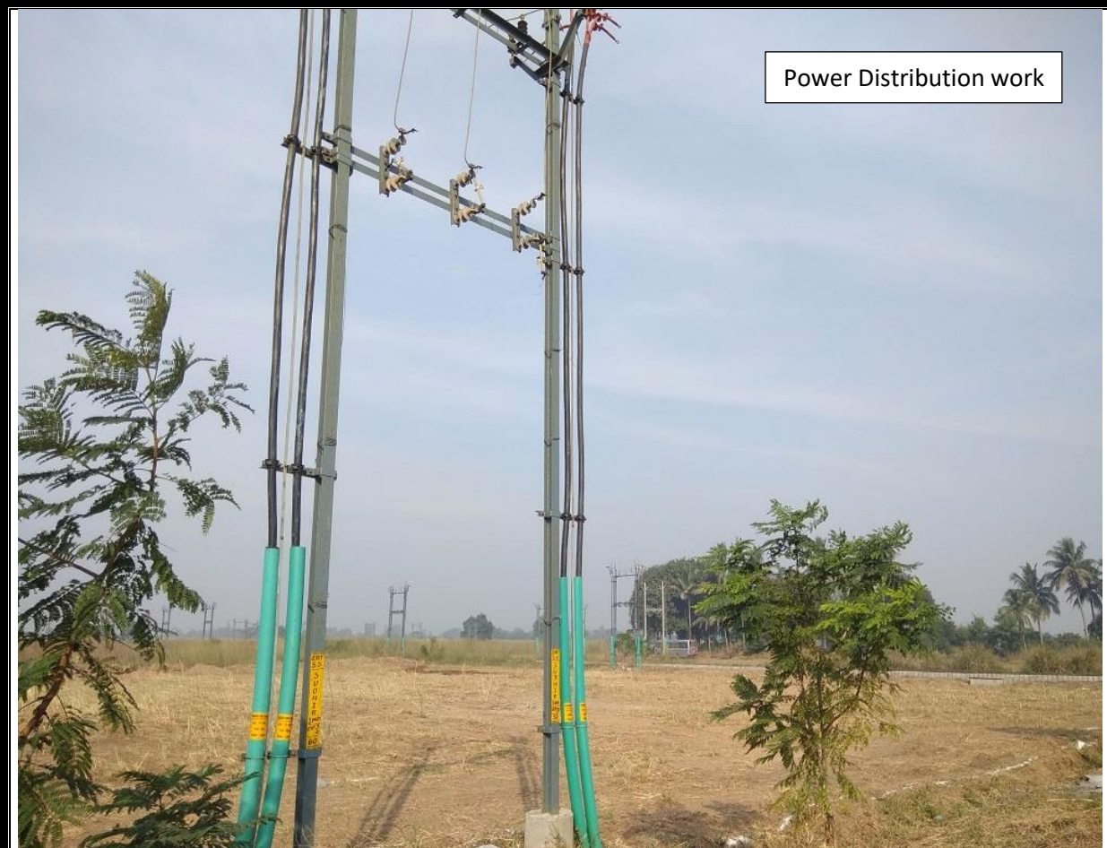
Power Distribution work