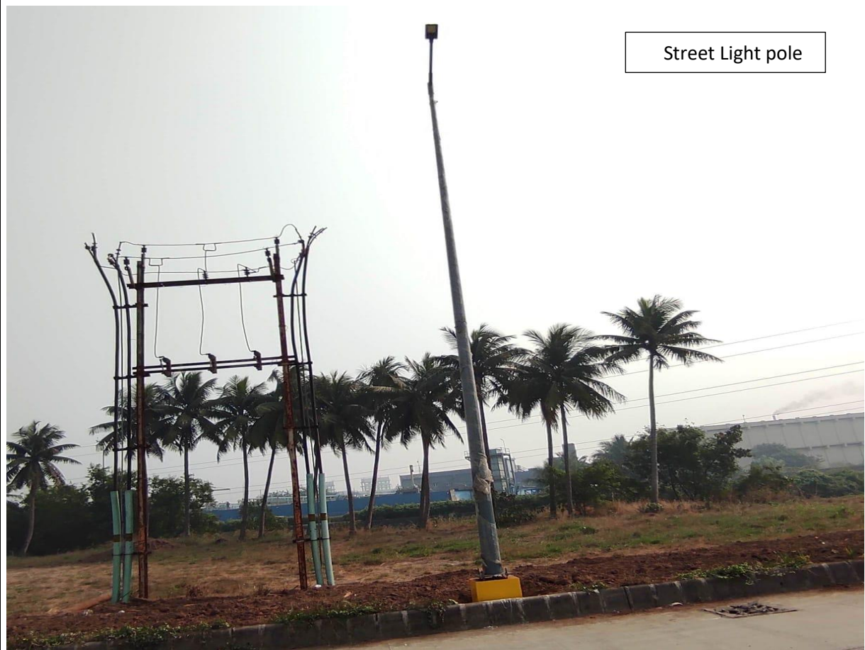
Street Light pole