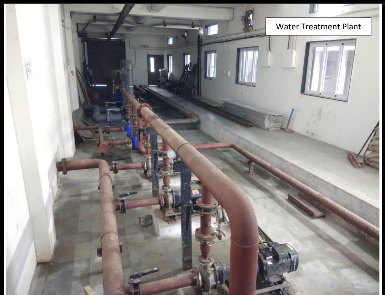
Water Treatment Plant