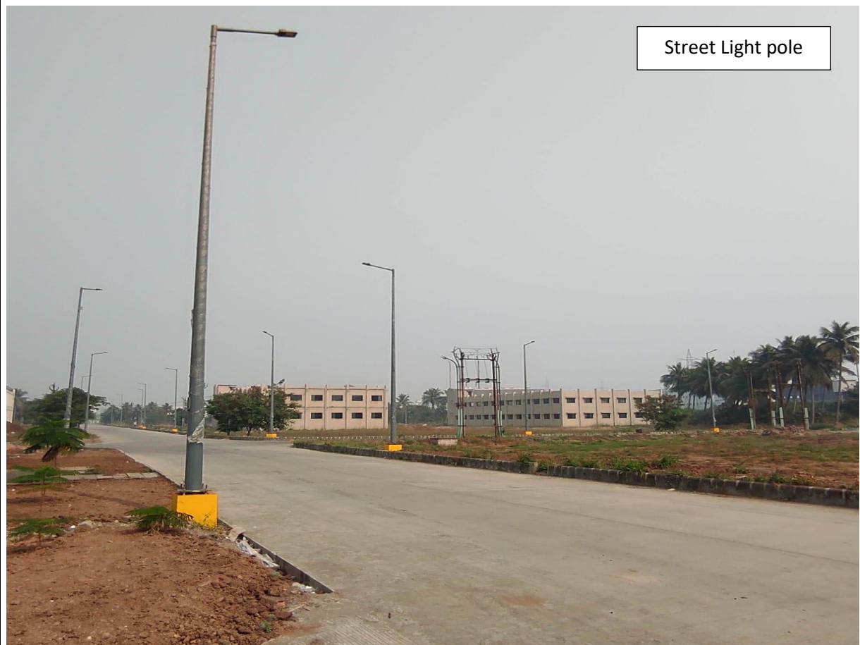
Street Light pole