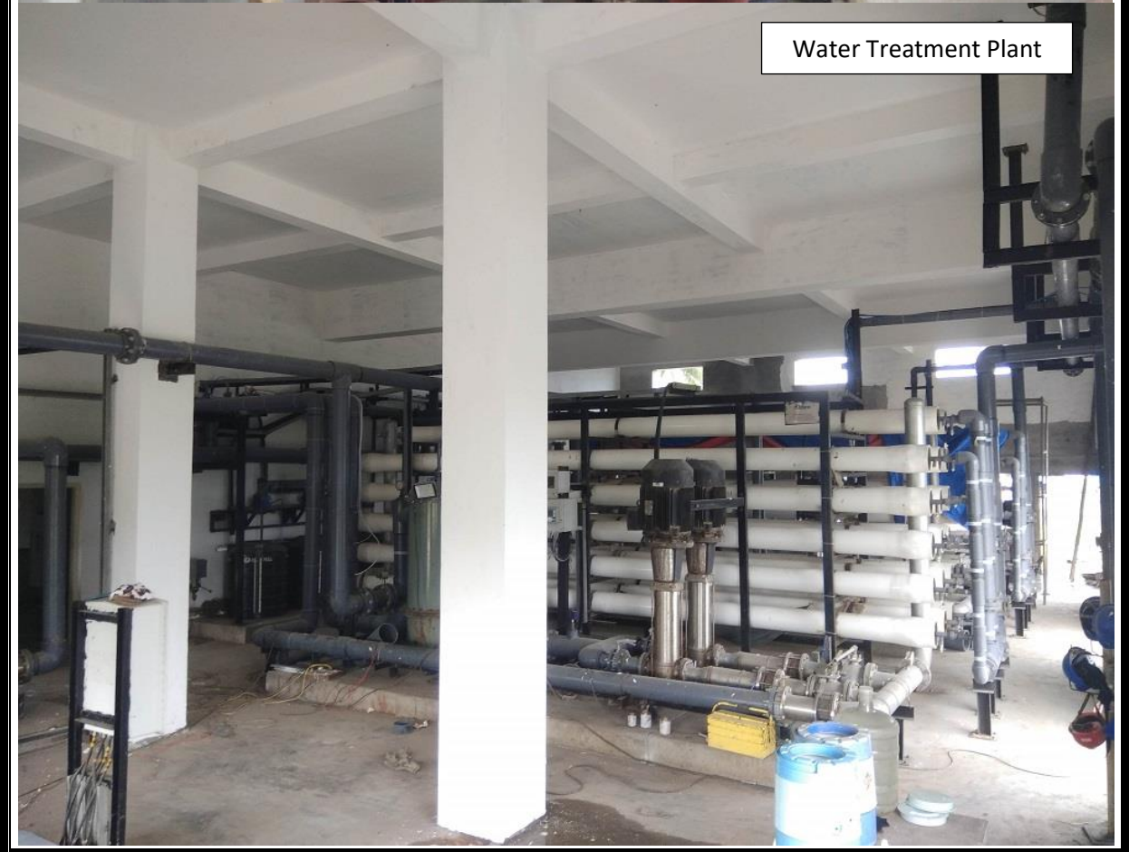
Water Treatment Plant