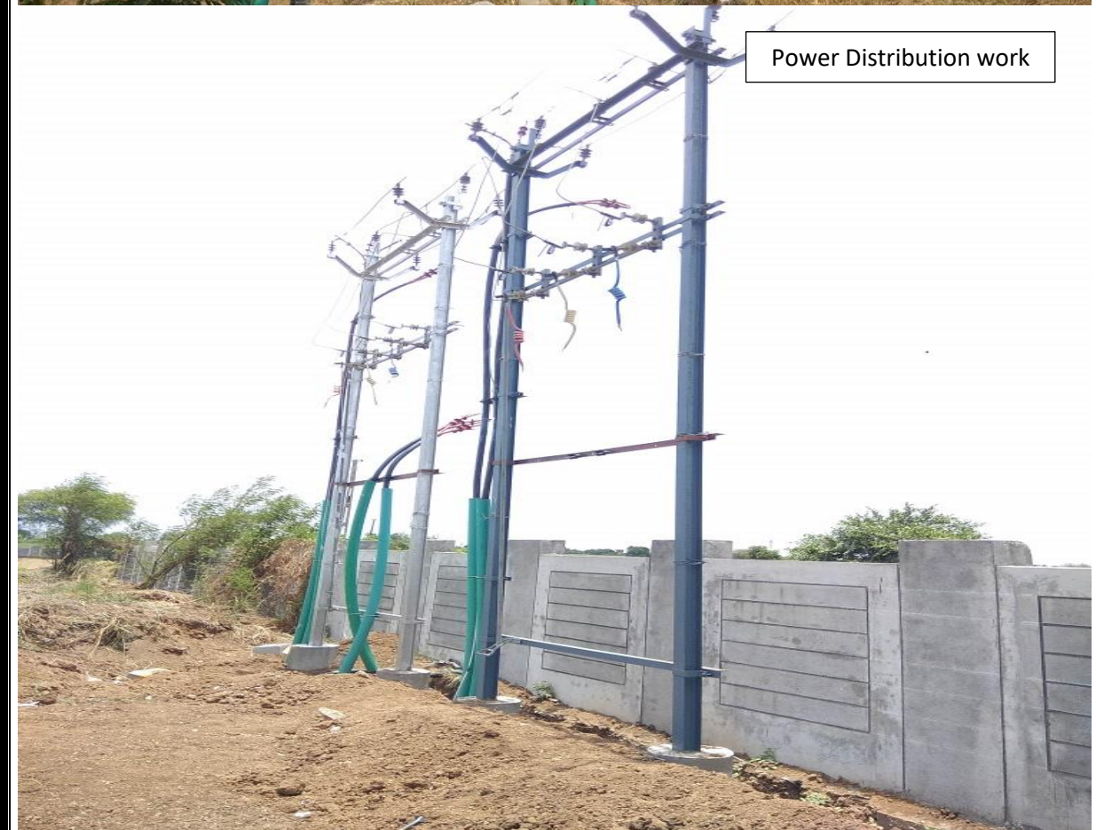
Power Distribution work